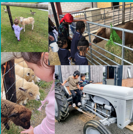
Mini Meadows supported by Waitrose