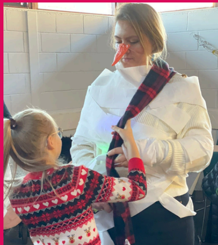
Family Christmas Party